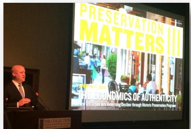
Mayor Mitch Landrieu of New Orleans

Co-sponsored by the Preservation Resource Center (PRC) and the Tulane School of Architecture, this third Preservation Matters gathering since its 2009 inception coalesced around the theme of The Economics of Authenticity. Held April 16-17 in The Historic New Orleans Collection’s Williams Research Center, the symposium commenced with a circuitous downtown New Orleans tour of successes and challenges, conducted by co-organizers